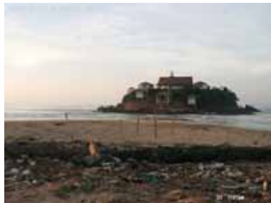
Bridge Connecting with Religious Place was Washed Away, Matara