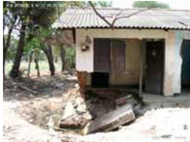
Erosion by Tsunami, Trincomalee