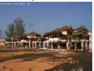
Resort Hotels Damaged by Tsunami Wave, Khao Lak Beach, Phang-nga