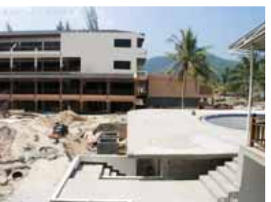
A Damaged Hotel in Phuket