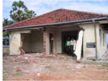
The Wall Pushed Down by Tsunami, Trincomalee