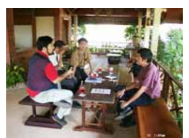
Interview with Hotel Managers