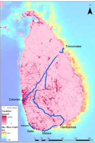
Field Survey Route (Feb.17-26,'05)