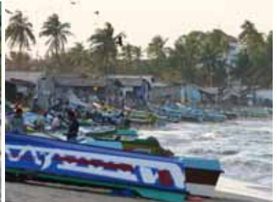
A Fisher's Village, Trincomalee