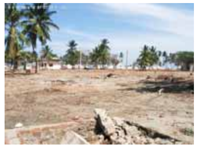
Demolished Area, Hambantota