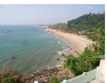
Khao Lak Beach