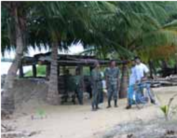
On the Border between Central Government and LTTE, Trincomalee