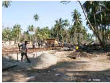
Damaged Railway Facilities, Kahawa