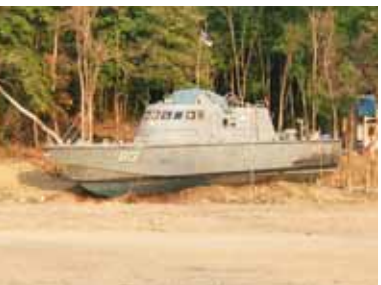
Thailand Navy's Ships Landed by Tsunami Waves, Khao Lak